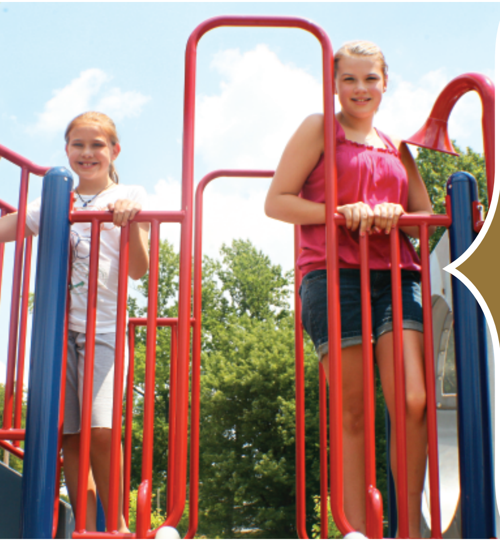
Local Bedford children playing on the new Edgewood Park playground

Vectren Foundation supports events that celebrate the spirit of community, diversity and good citizenship. Foundation contributions are generally awarded to programs or agencies that meet the following criteria: