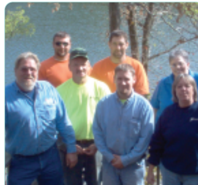
Columbus employees work at youth camp