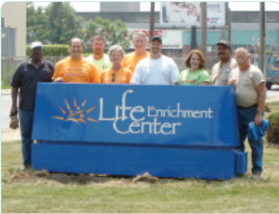
United Way of the Greater Dayton Area Community Care Day