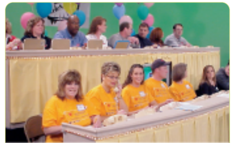
Ball State University's WIPB-TV Spring TeleSale

Vectren employees were the driving force behind a multitude of grassroots initiatives in their communities in 2007 – both in contributions and volunteer hours. They donated more than 20,000 hours of labor in 2007 to help nonprofit organizations across Vectren's service territories – a 15 percent increase over the number of hours contributed in 2006. From digging dirt in landscaping projects to stocking the shelves of food pantries, Vectren employees volunteered their time and talent to projects designed to strengthen the social fabric of their communities. Many of the Vectren employees were able to leverage their efforts into real dollars for these community projects, qualifying for community service matching grants and community partnership project grants from the Vectren Foundation.