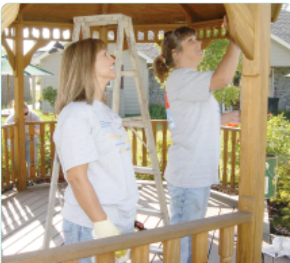
Evansville employees stain a gazebo during Day of Caring