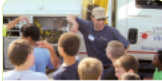
Vehicle Day in Xenia, Ohio