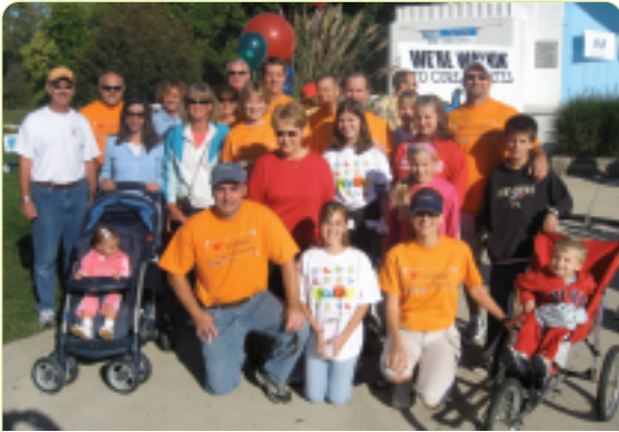
Juvenile Diabetes Research Foundation Walk in Dayton, Ohio

employees changing communities and lives