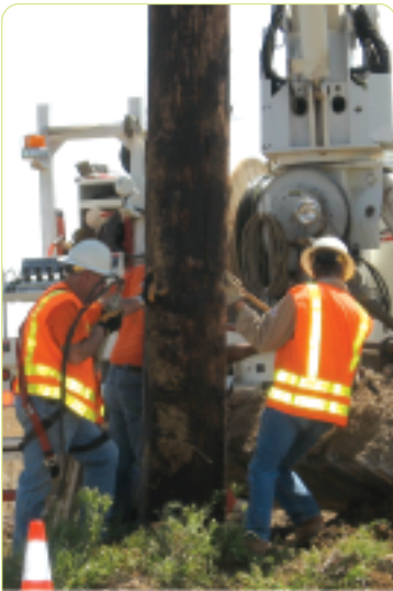
Mt. Vernon crew replaces a storm siren