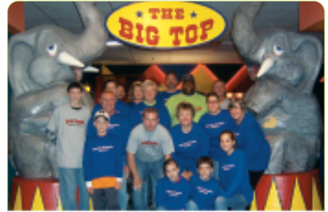
Hamilton County Special Olympics in Noblesville