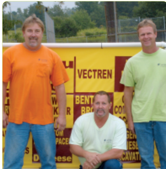
Gibson Southern High School soccer concession stand