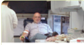
Blood drive in Muncie, Indiana