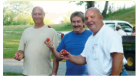
Kid's Night Out program in Greencastle, Indiana