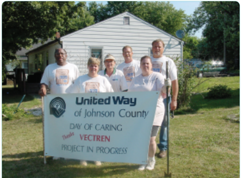
Franklin, Indiana, employees volunteering for Johnson County Day of Caring